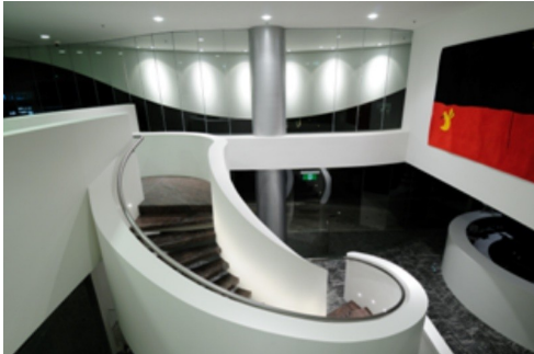
Stairway - AF Sydney

Pascale and Nerida were our delegates. They were very impressed by the beautiful venue for the Conference, The Alliance Centre de Sydney which was opened in November 2009 and is the last commercial building designed by Harry Seidler . The building is of modern design, thirteen storeys high and features a spectacular circular granite stairway which links three floors, thereby creating a natural flow between the Café, classrooms and media centre. A Parisian style café, operated by the renowned restaurateur Becasse, provided delectable refreshments for lunches.