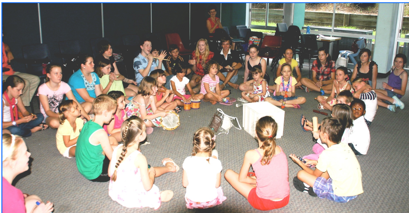
Participants in the first French Language Workshop for Children